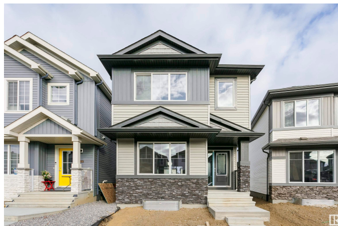
9530 Carson Bend SW, Edmonton, AB

Main Floor Exterior Area 74.32 m 2 Interior Area 68.37 m 2