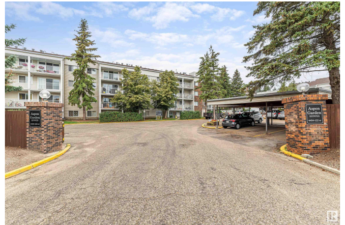
401-4404 122 St NW, Edmonton, AB