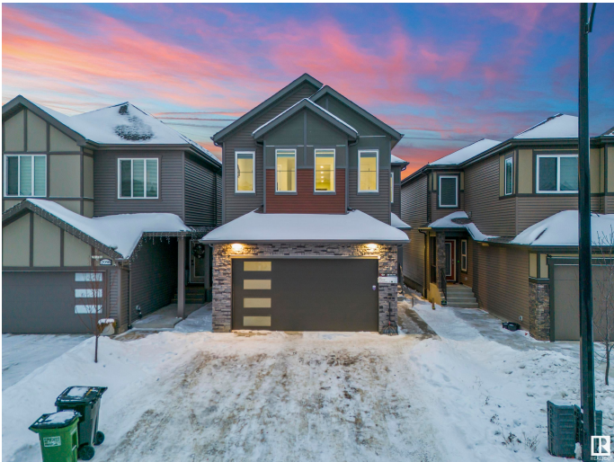
2096 Graydon Hill Cres SW, Edmonton, AB

1st Floor Exterior Area 1223.15 sq ft Interior Area 1121.19 sq ft Excluded Area 170.94 sq ft