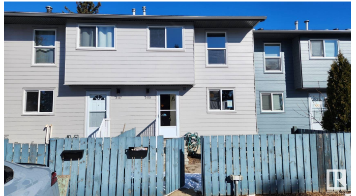
3115 144 Ave NW, Edmonton, AB

Investor Alert or Perfect First Home! This spacious 3 bed, 2.5 bath townhome offers a functional layout with a partially finished basement featuring a rec room and half bath. Conveniently located next to the Anthony Henday for easy commuting. Clareview LRT Station is close by, and you're just minutes from Costco, Superstore, Walmart, and the Clareview Community Rec Centre. Situated near good schools and the river valley trail system, this location offers both convenience and lifestyle. A great opportunity with cashflow potentialâ€”donâ€™t miss it! Please note the property is sold as is where is at time of possession. No representations or warranties